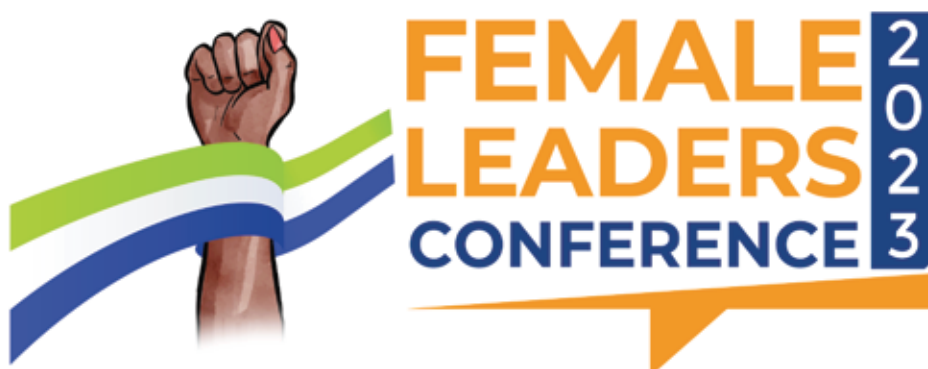
Figure 1: Proposed Logo for the Conference

To further advance the cause of female leadership, SEND-SL proposes a two-day National Female Leaders Conference scheduled for the 5th and 6th of September, 2023. This conference seeks to convene all elected Female Members of Parliament, Councilors, Chairpersons/Mayors, Deputies, and other influential figures. Through this collective platform, SEND-SL aims to strengthen the voice and impact of female leaders, fostering a united front in their pursuit of a more equitable and inclusive Sierra Leone.